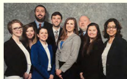
UAB Team, Observers and Faculty