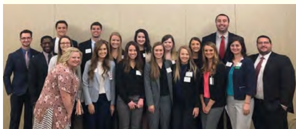
MHA Students at Opioid Roundtable Discussion

The UAMS MHA Program organizes monthly Lunch with the Administrator meetings to provide students with an opportunity to interact with healthcare executives. This spring term, students attended a luncheon at the Arkansas Children's Hospital and at Baptist Health Physician Partners . The MHA students also had the opportunity to participate and attend various other professional development activities: