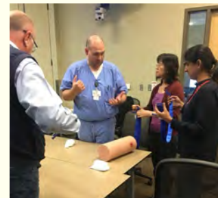
Stop the Bleed Training